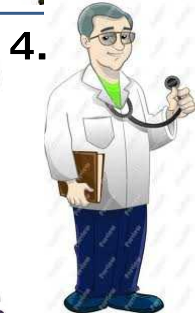
a doctor いしゃ