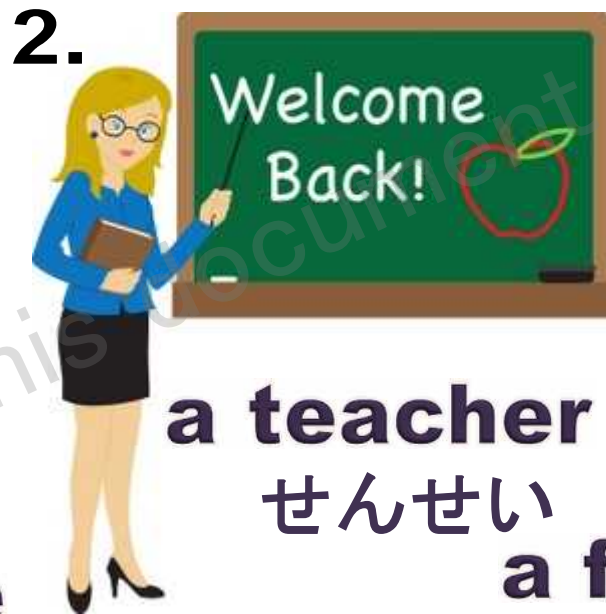
a teacher せんせい