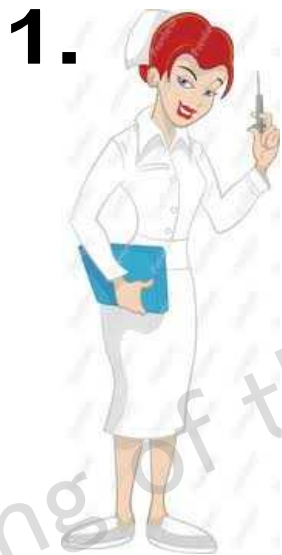
a nurse かんごし