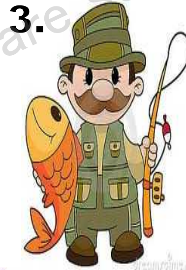
a fisherman りょうし