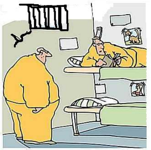
"A break-out? Forget it. Security's too tight. Can't even break out in a sweat around here without getting caught."

Common phrasal verbs, with meanings and examples. Phrasal verbs are usually two-word phrases consisting of verb + adverb or verb + preposition . Think of them as you would any other English vocabulary. Study them as you come across them, rather than trying to memorize many at once.