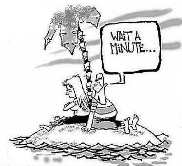
WHEN YOU SAY YOU WANT TO "GET AWAY FROM I ALL," YOU'RE TALKING ABOUT ME AREN'T YOU?