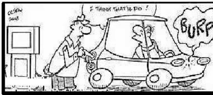
'I think that'll do!' says man to attendant filling up car, as car burps.

Common phrasal verbs, with meanings and examples. Phrasal verbs are usually two-word phrases consisting of verb + adverb or verb + preposition . Think of them as you would any other English vocabulary. Study them as you come across them, rather than trying to memorize many at once.