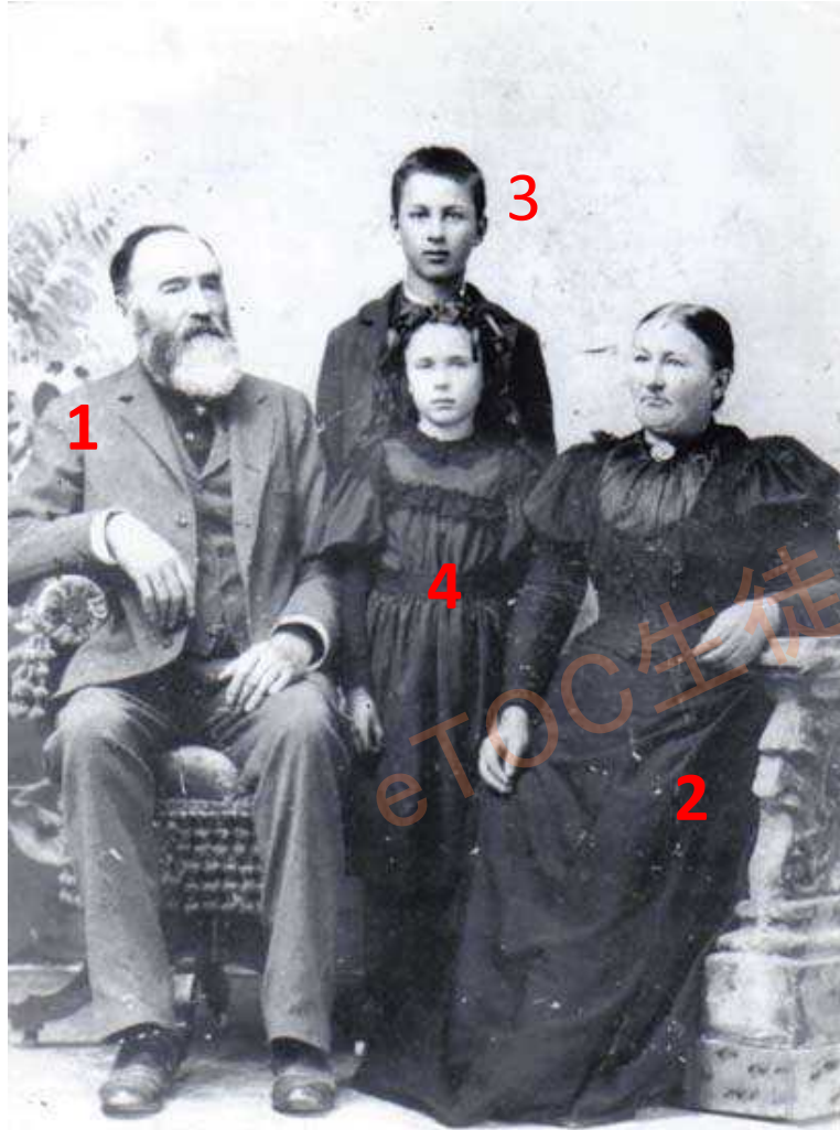
The Frost Family